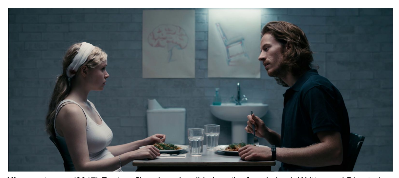
Hippopotamus (2017) Feature film where Ingvild plays the female lead. Written and Directed by Ed Palmer